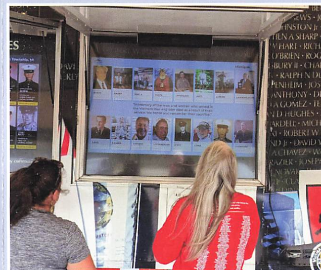
In Memory honorees on display at The Wall That Heals

If you have any questions regarding the application process, please contact VVMF at: inmemory@vvmf.org