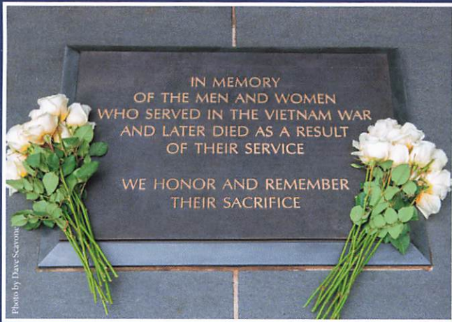
Plaque at the Vietnam Veterans Memorial in Washington, D.C.

"It was a weekend that our family shared together and I am amazed at the bonding that took place. It almost felt spiritual. We are all still processing all the emotions that we felt and it was WONDERFUL. I did not really know what to expect, but it exceeded anything I could have expected."